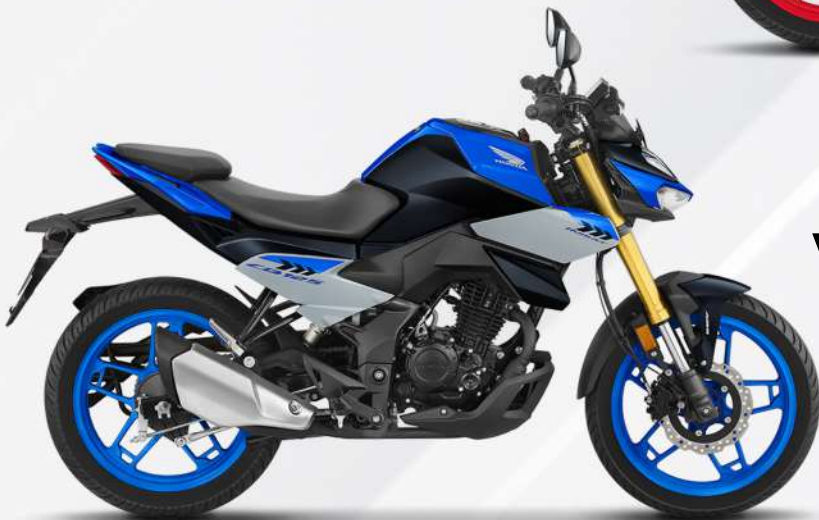
Pearl Siren Blue with Athletic Blue Metallic