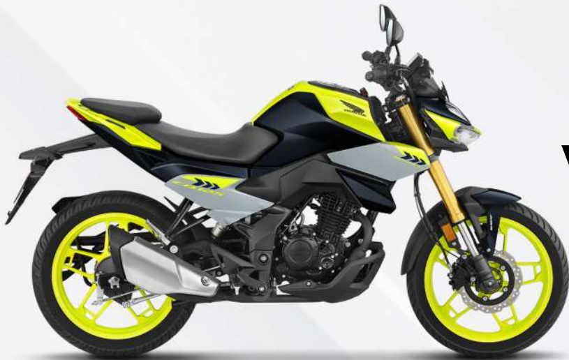
Pearl Siren Blue with Lemon Ice Yellow