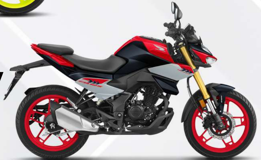
Pearl Siren Blue with Sports Red